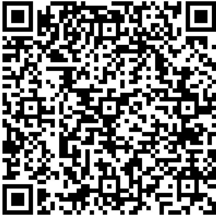
Camp Cris Dobbins Program Guide

A temporary link is on the website or use the QR code below.