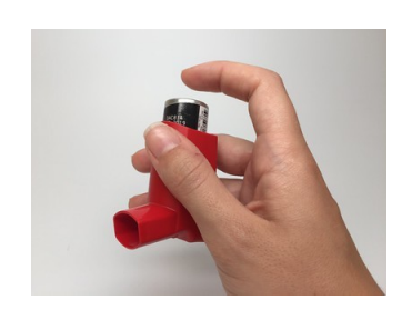
"Asthma inhaler" by NIAID is licensed under CC BY 2.0.