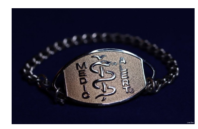
"My Most Valuable Piece Of Jewelry"