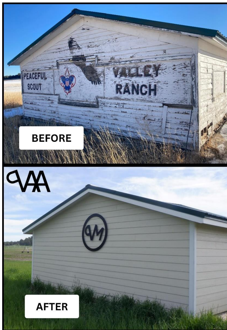
Before and after pictures of the Warming Shed.

There is still a third phase we'd like to complete on this project. The interior needs to be cleaned out, insulation and sheathing installed along the ceiling, and then install solar powered lights.