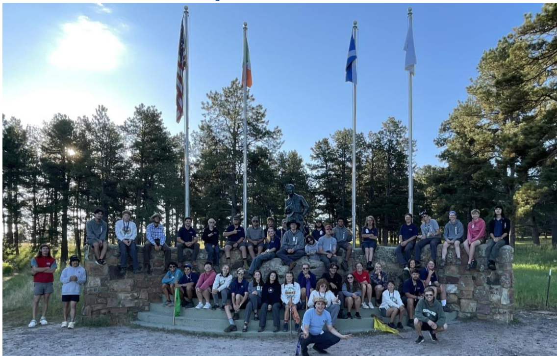
Picture of the '23 PV staff on the last day of campers for the summer.