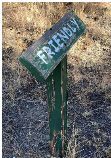
Example of condition of the old signs