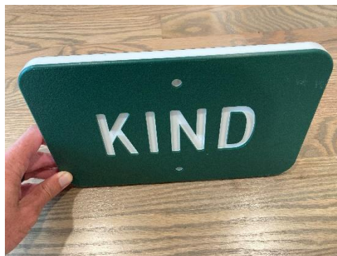
One of the new signs made from routed HDPE, similar to what can now be found installed at National Forest trailheads.